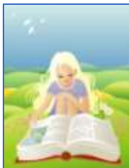
Image-link: <a href="http://www.example.com/"><img src="URL" alt="Alternate Text" /></a>

<a href="http://www.example.com/">Link-text goes here</a>